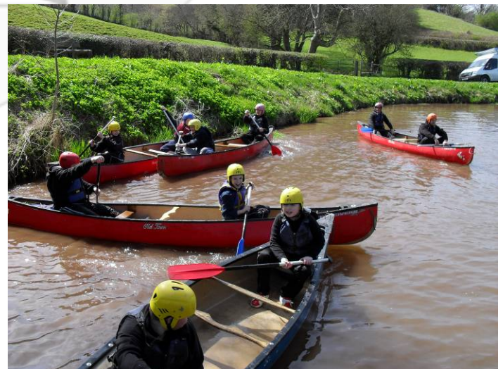
Kayaking at Storey Arms

In addition, the pupils are welcome to join the rest of the school on visits which include trips to Paris, skiing, Storey Arms and many more.