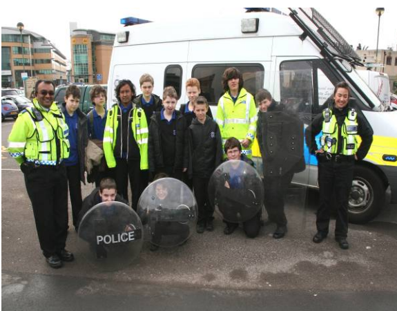
Independent travel training