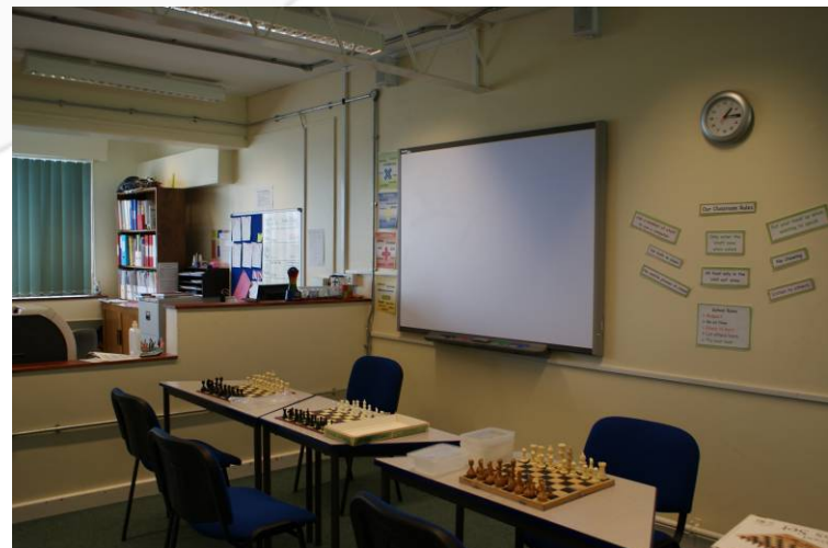
Access base classroom