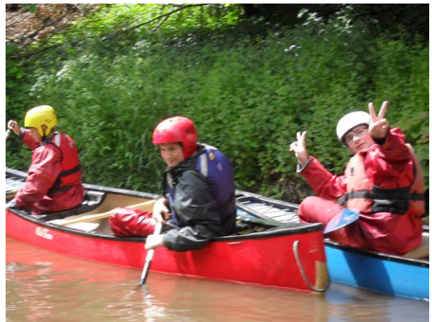
Storey Arms 2011