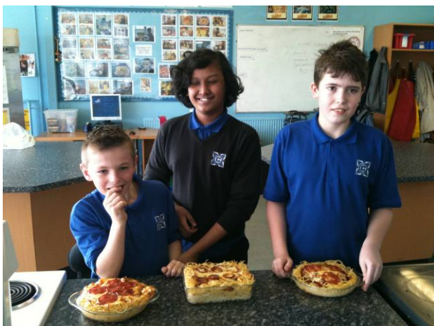
Independent skills lesson

In addition, we are establishing links with the local community. We run additional life skills sessions where we make simple meals. As part of this, we go shopping to the local supermarket where the pupils are encouraged to navigate their way around to buy the items needed for their meal. They are then guided on how to use the self checkout. This teaches them how to follow instructions and how to handle cash.