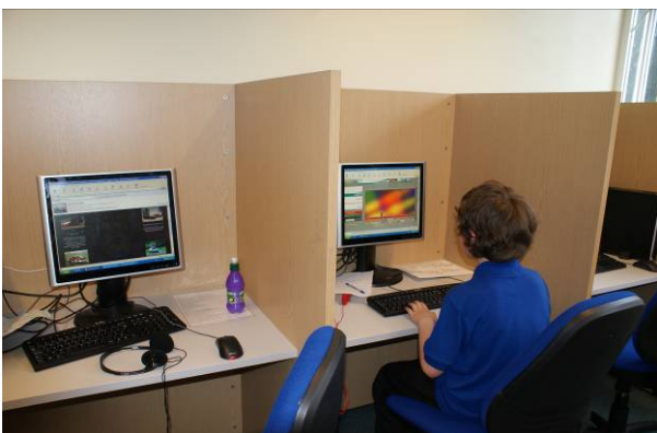
Pupil completing homework

Your child will be given homework by class teachers. Staff in the Access base will offer support during allocated times in the base to do some of their homework. The amount that is sent home can be decided between us when your child starts school. It can also be reviewed regularly.