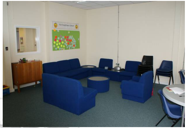
Chill out room