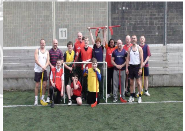
Additional PE lessons