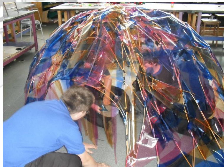
PSHE day activity

During the Autumn term, your child will have an Individual Education Plan (IEP) setting out their targets. This IEP is discussed and agreed by the pupil and yourselves. When finalised, these get issued to all staff. Where necessary, a pupil will have a Behaviour Management Plan (BMP) issued and in some cases, a Pastoral Support Plan (PSP). At some point during the year, an annual review will be organised to review their statement of special educational needs.