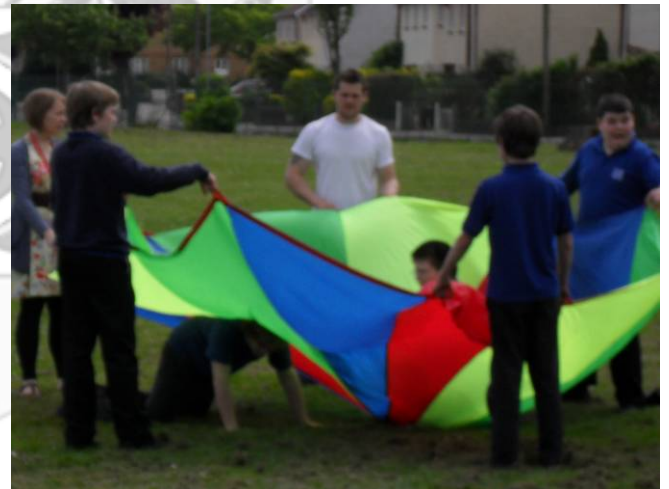
Social skills lessons

All pupils in the base receive a social skills lesson once a week. These lessons are tailored to meet the needs of the individuals. The sessions aim to develop their understanding of topics such as emotions, friendship, making choices, appropriate behaviour etc. They are fun, interactive sessions run as a whole group or as individual session dependent on need.