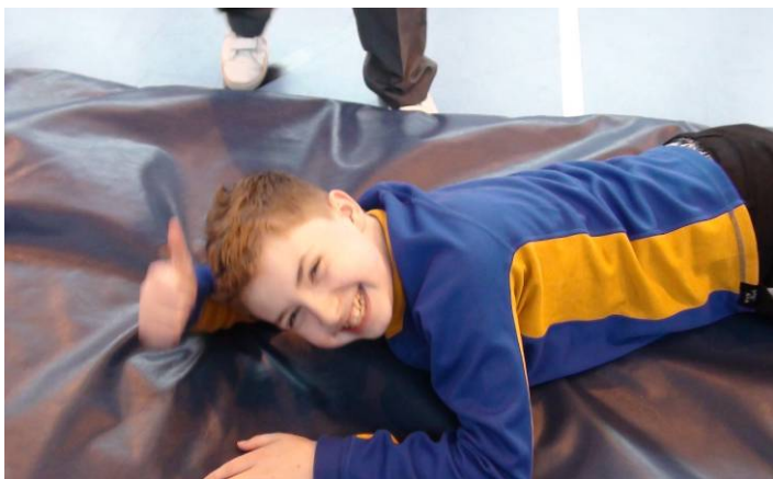
Access base fitness programme